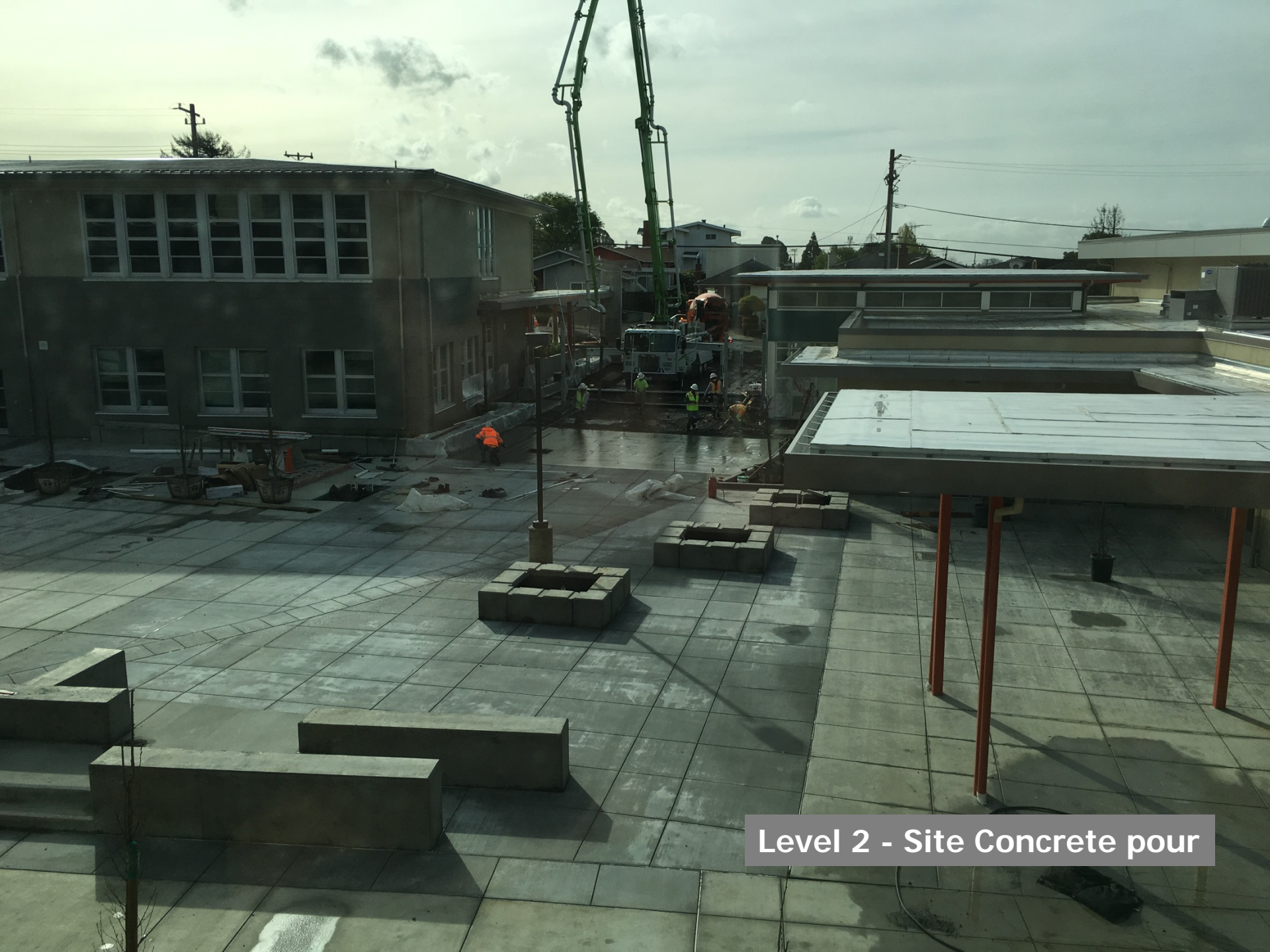
Level 2 - Site Concrete pour