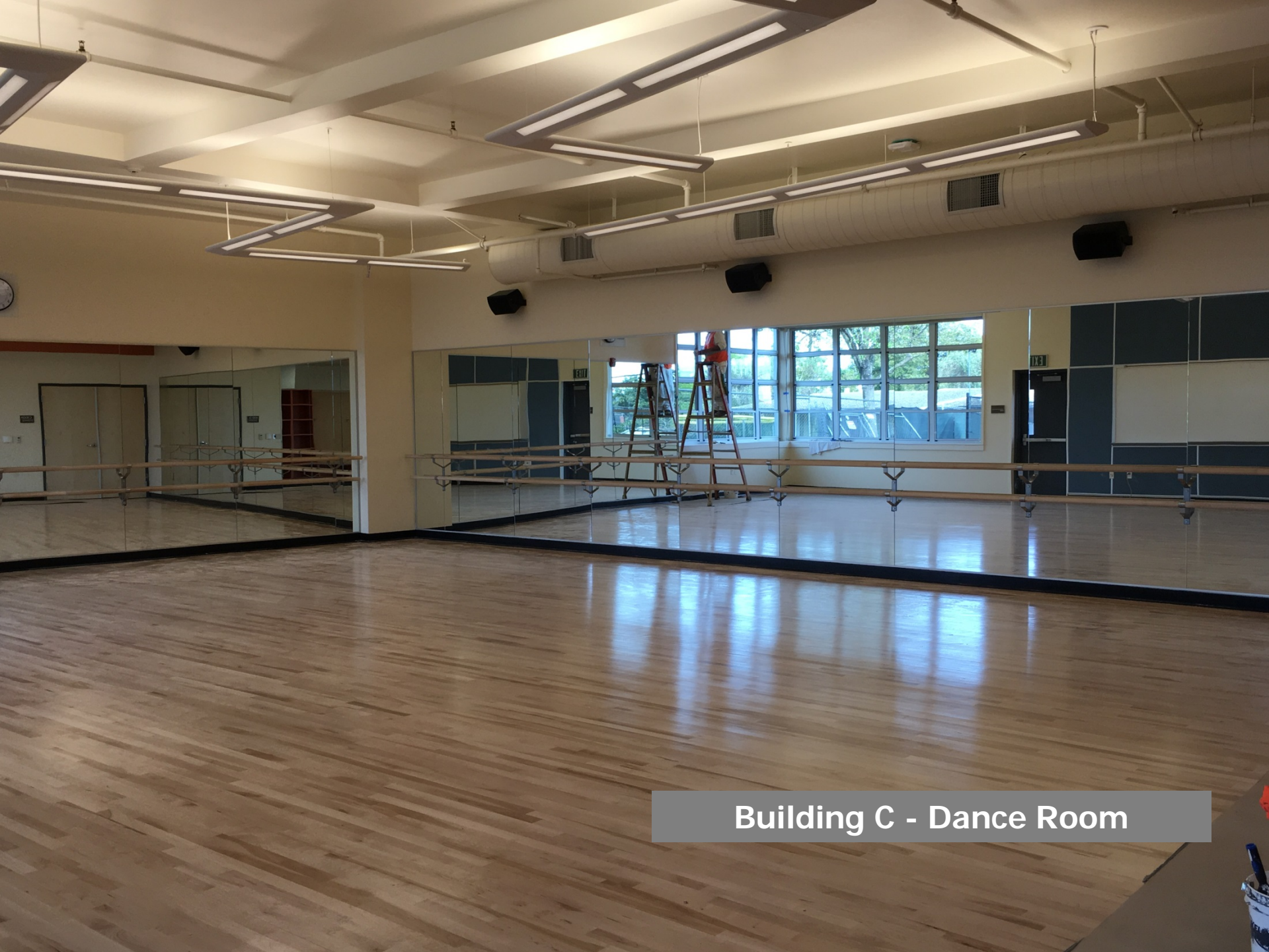
Building C - Dance Room