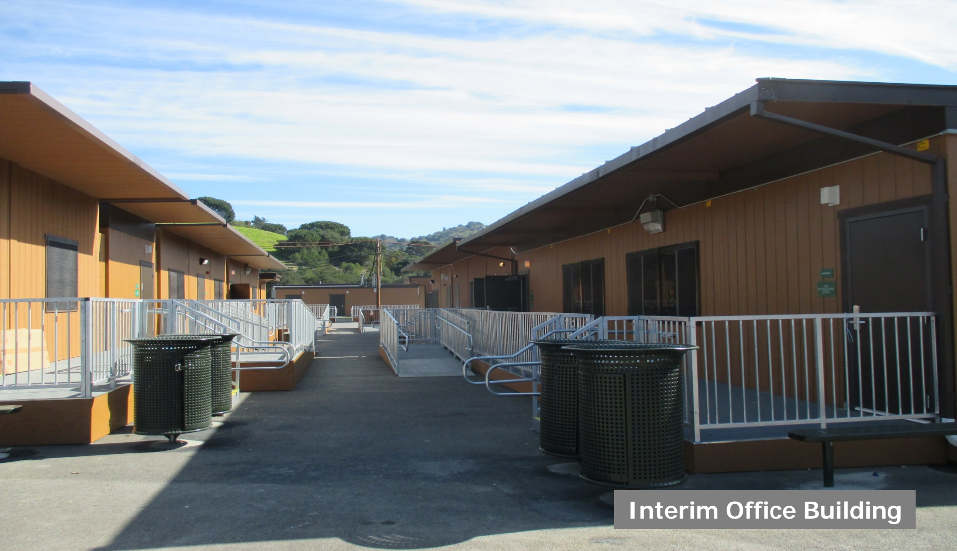
Interim Office Building

Contract Value: $3,466,000 Change Order: 4.11%