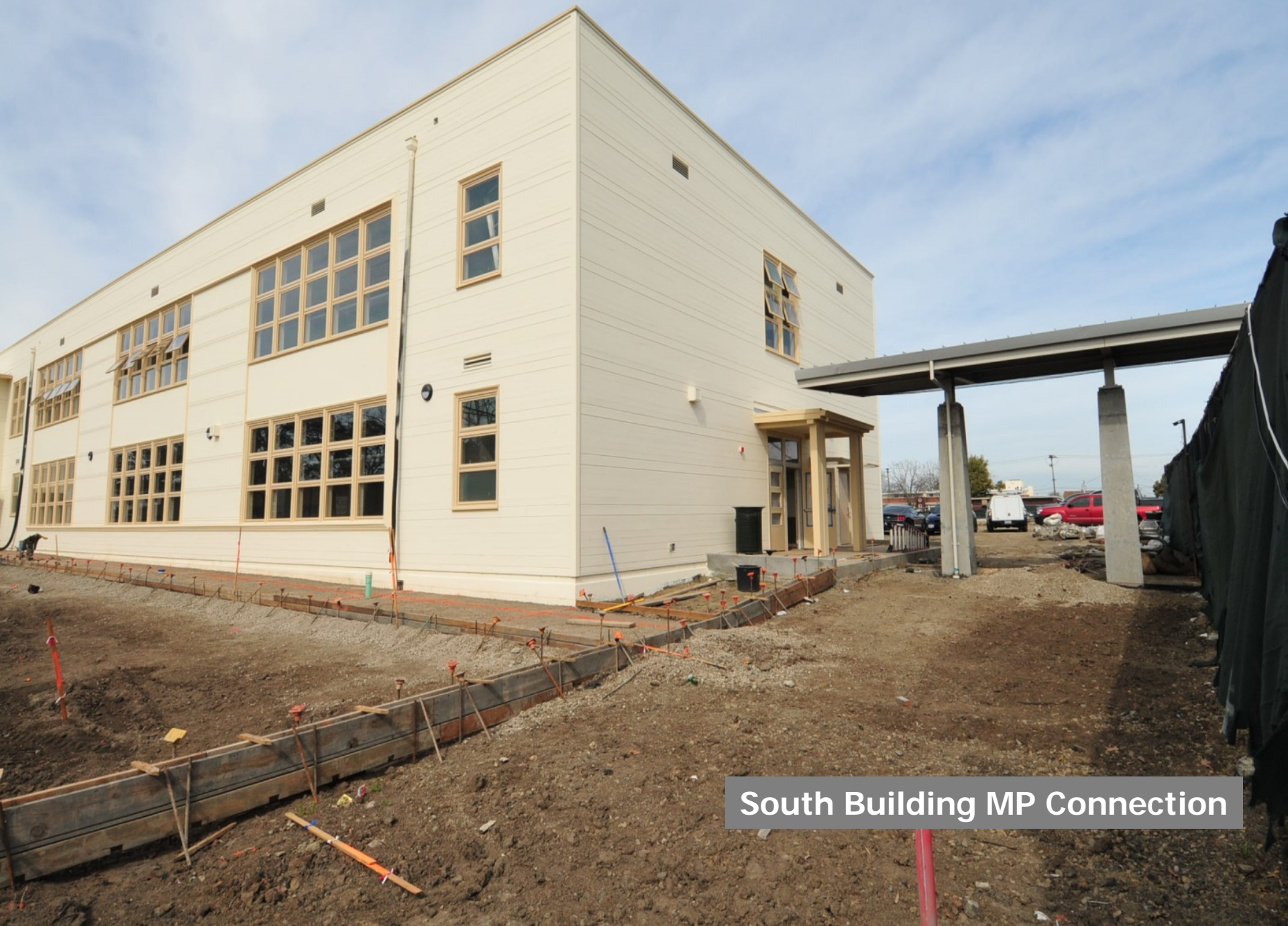
South Building MP Connection