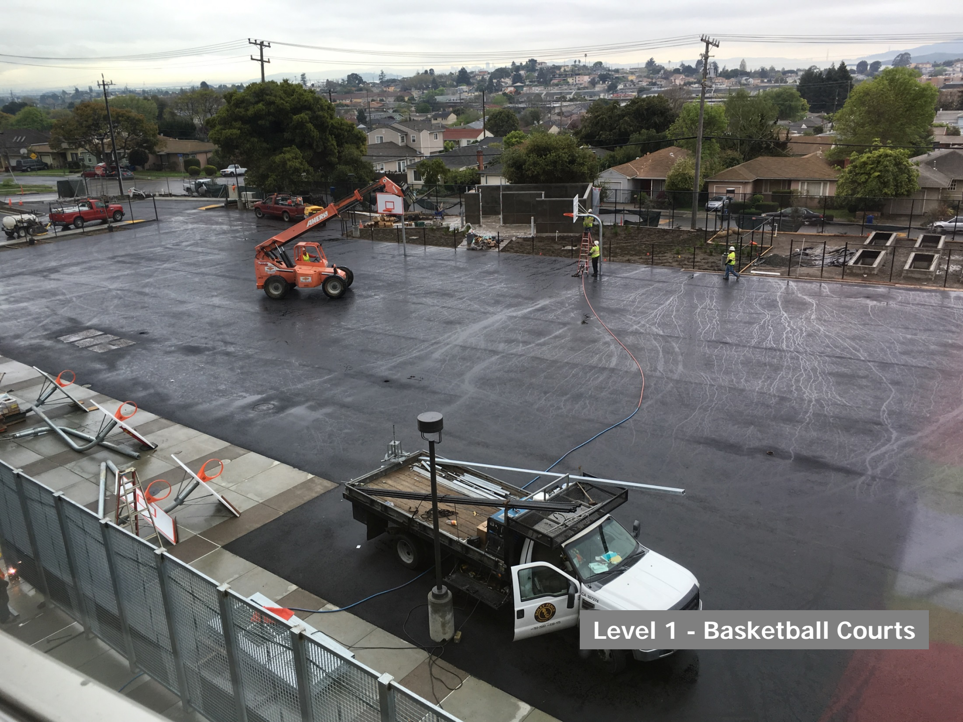
Level 1 - Basketball Courts