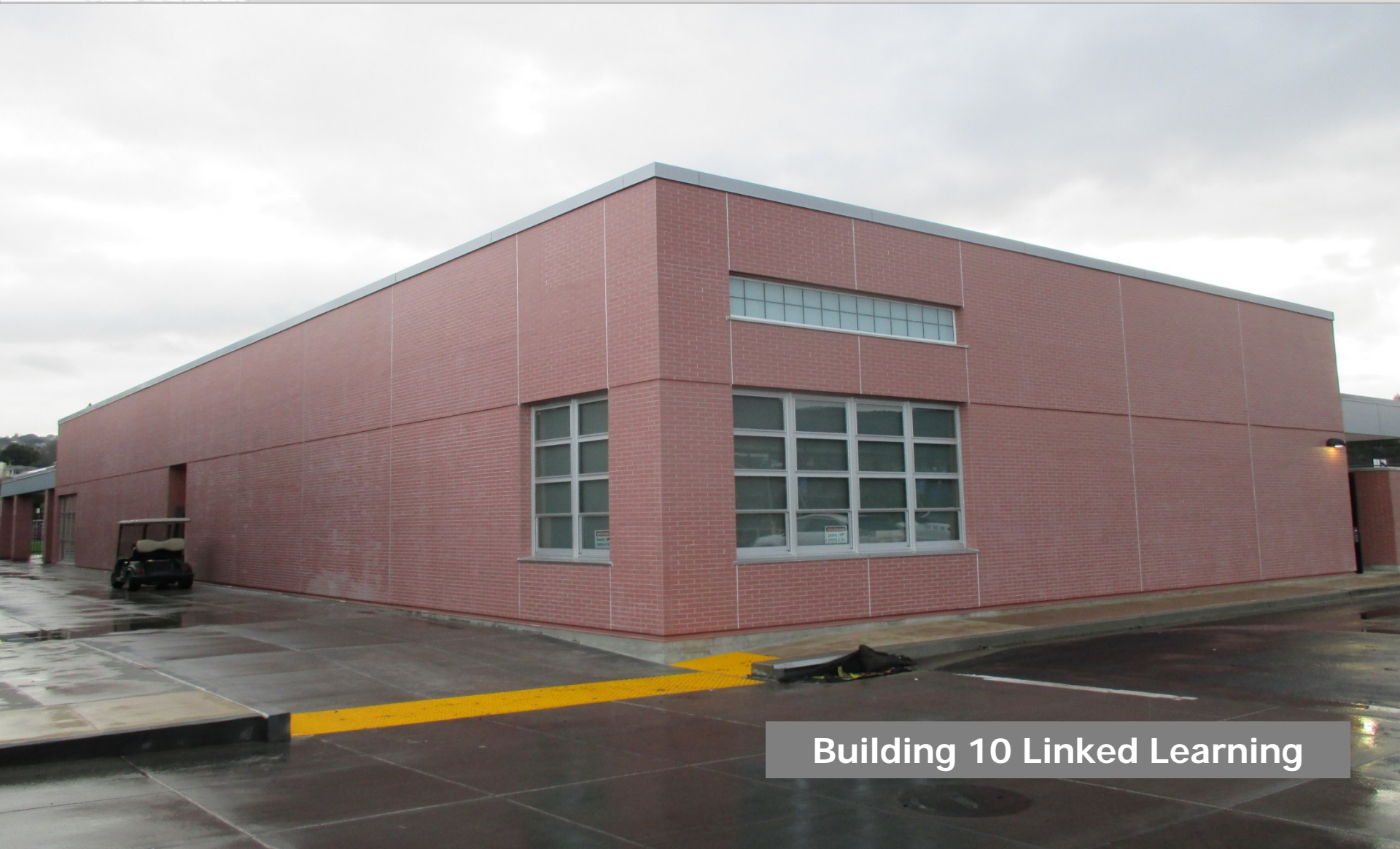
Building 10 Linked Learning

Contract Value: $17,750,953 Change Order: 3.17%