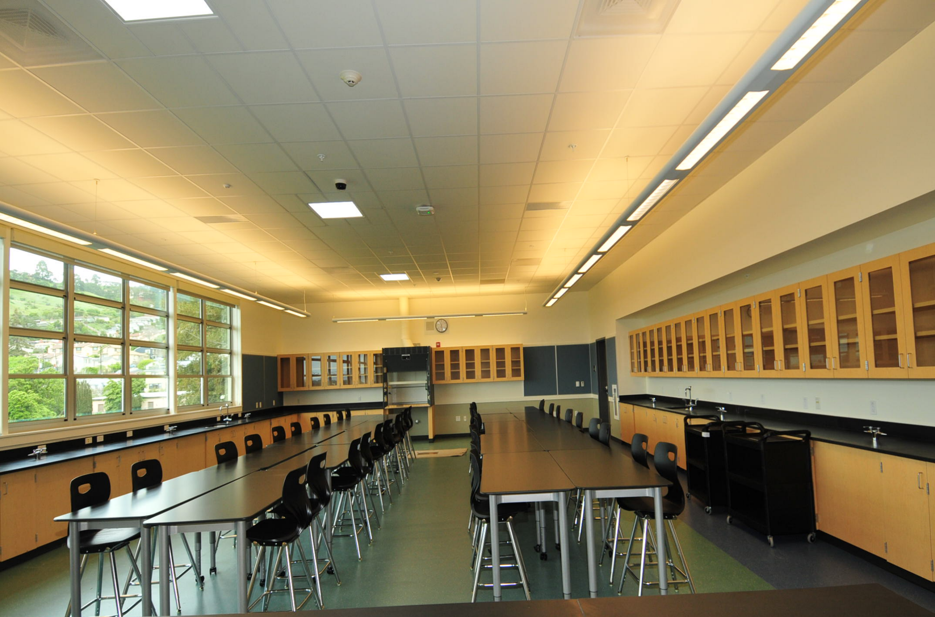
Building C - Science Classroom