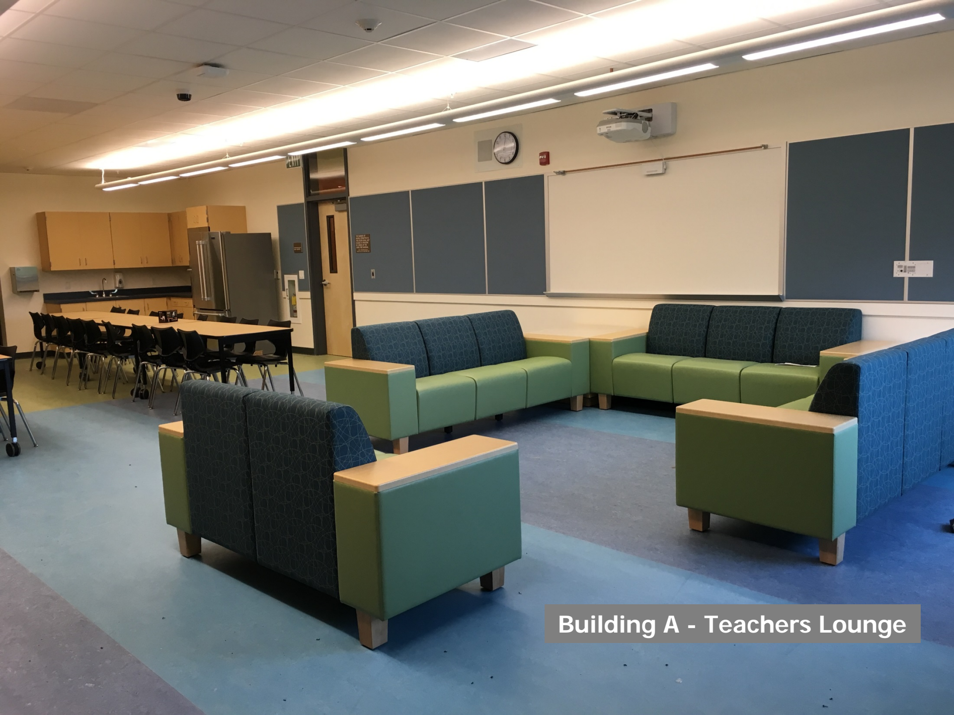
Building A - Teachers Lounge