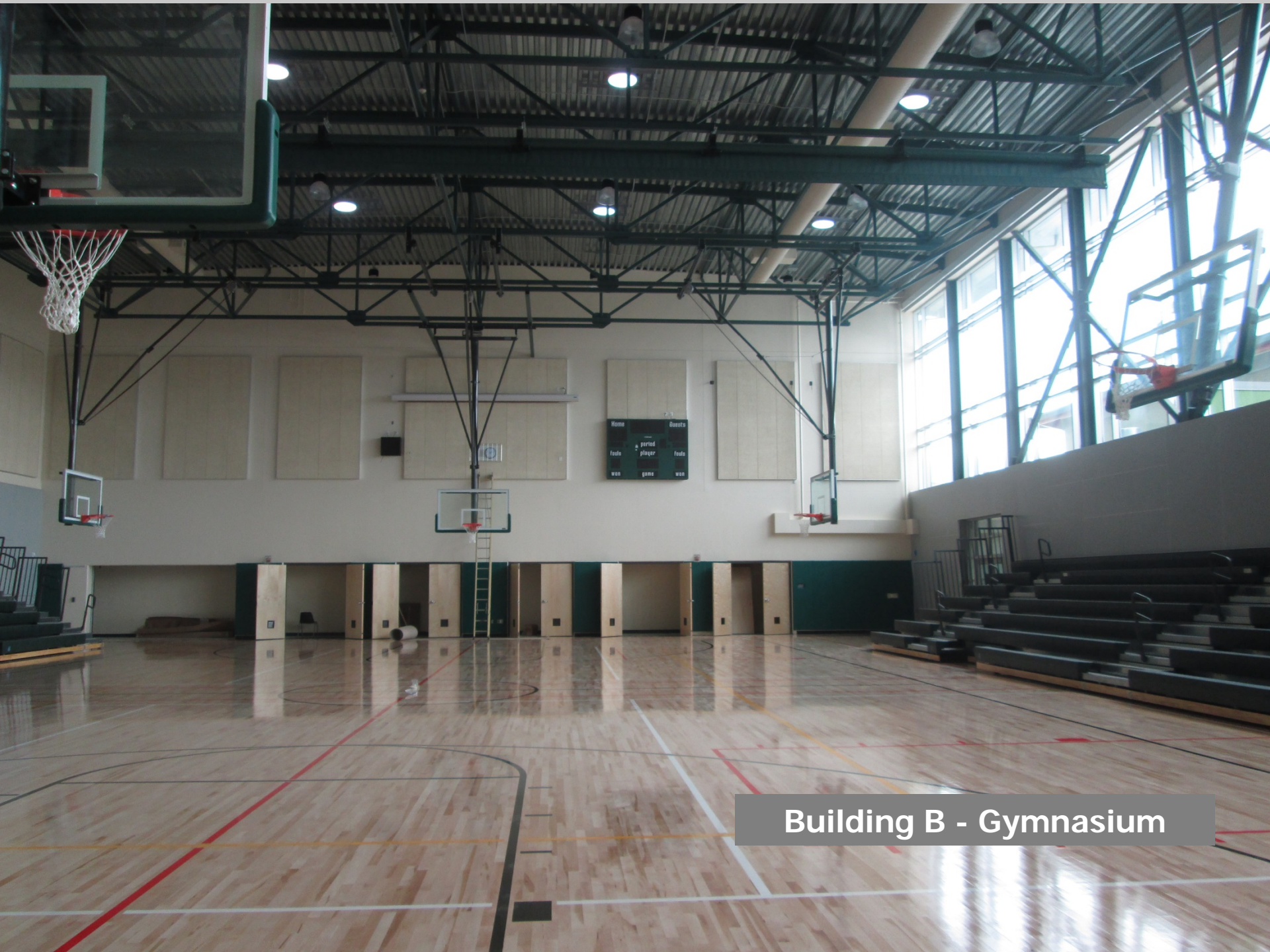
Building B - Gymnasium