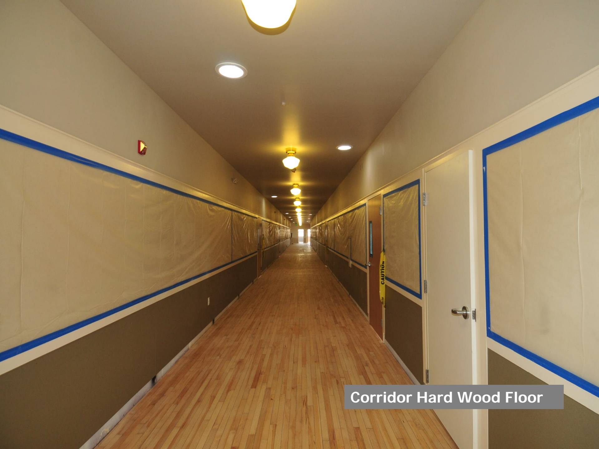
Corridor Hard Wood Floor