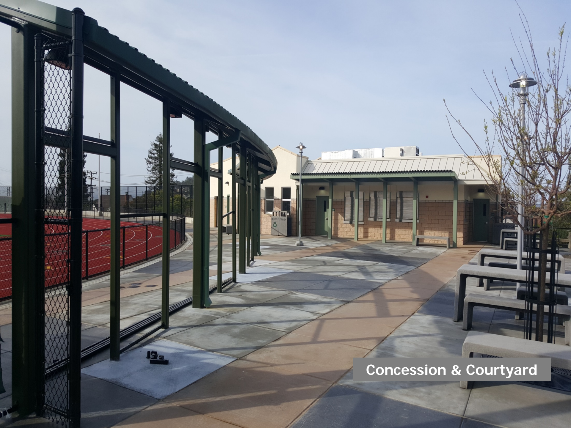
Concession & Courtyard