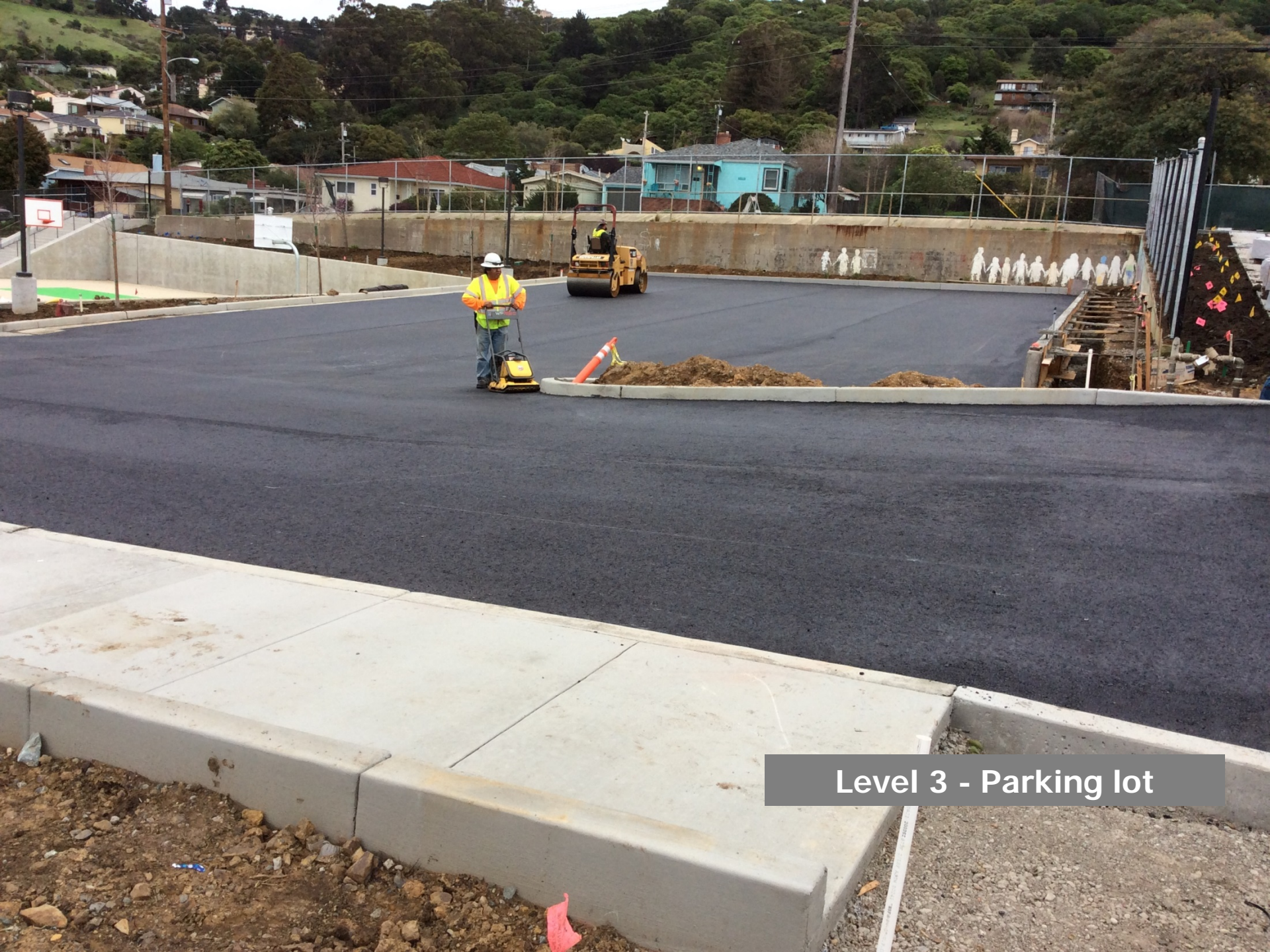
Level 3 - Parking lot