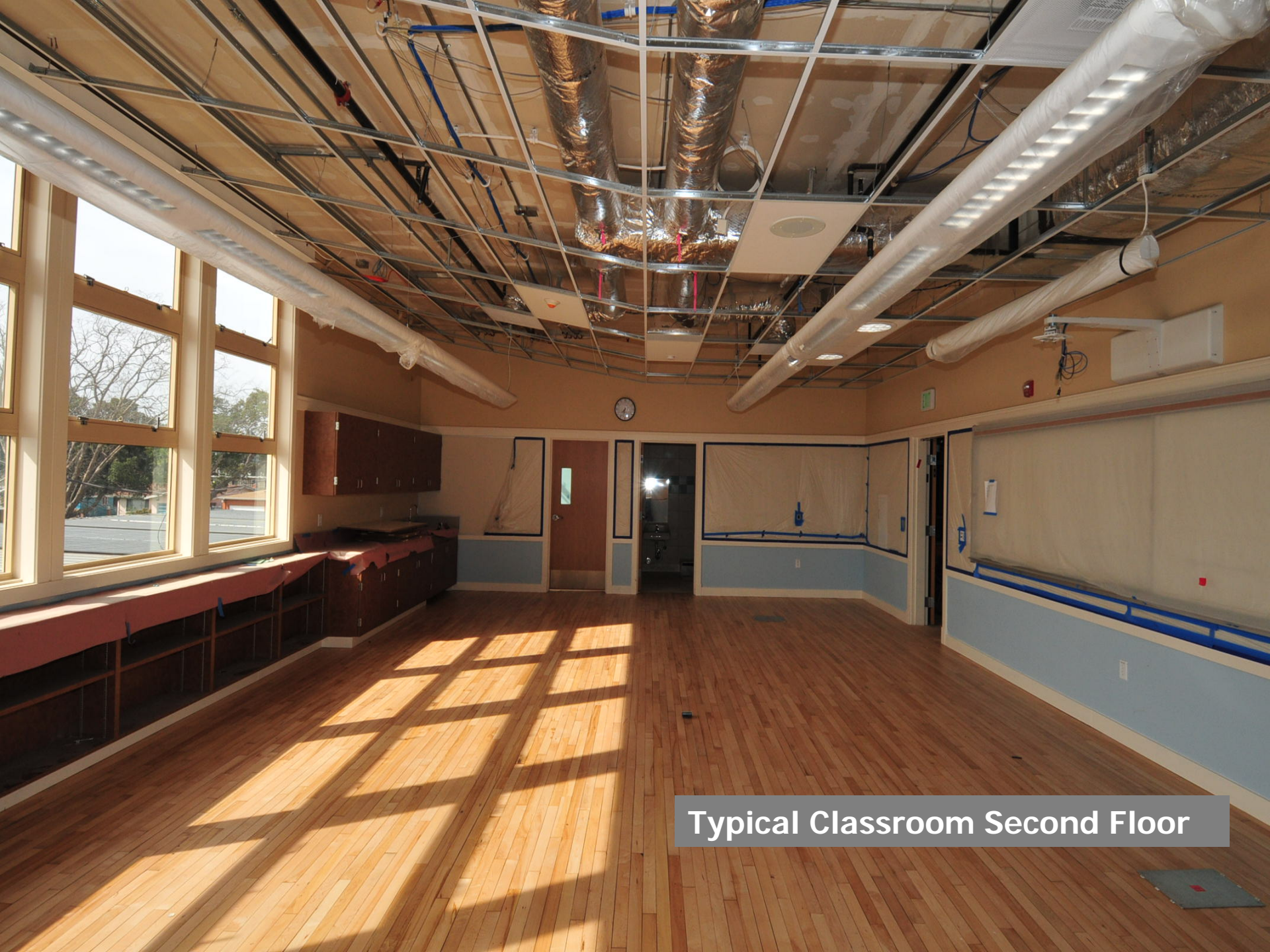
Typical Classroom Second Floor